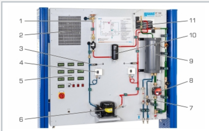
1 expansion valve, 2 evaporator with ventilator, 3 pressure sensor, 4 pressure switch, 5 displays and controls, 6 compressor, 7 cooling water flow meter, 8 pump, 9 hot water tank, 10 receiver, 11 cocondenser